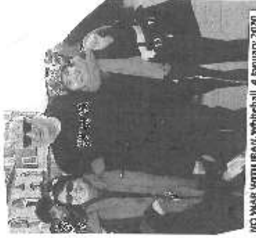
NO WAR WITH IRAN, Whitehall, 4 January 2020

In Brief I was born and raised in Durfleming and have been a voluntary Party secretary in Leeds, Nottingham and Brent. I led the first trade union action against Thatcher's privatisation of council housing and when I was a Labour councillor was arrested in 1985 for supporting the miners during the strike. With comrade socialist Labour councillors in Brent I refused to implement the Tory cuts. I support Palestinian rights and have been harassed by the IDF in 2015 during a peaceful protest against illegal settlements at Gilin. I am a UNITE branch secretary and represent workers every week in a range of sectors.